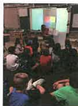
Fourth grade recognizing emotions in selves and others, September 2019