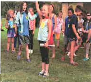
Caroline Wilderness Performance Academy August 2019